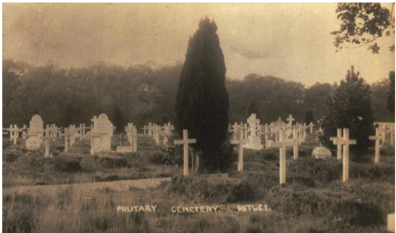
Original Cross markers – Netley Military Cemetery