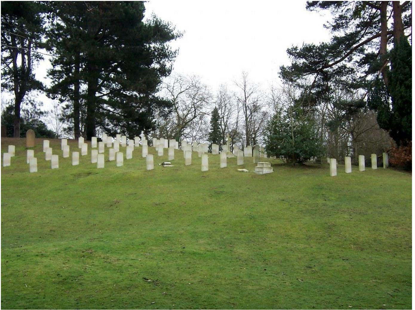
Netley Military Cemetery, Hampshire